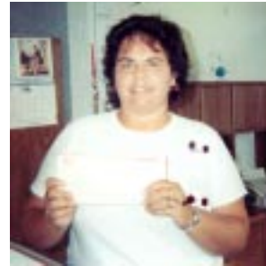
Livermore Falls Water